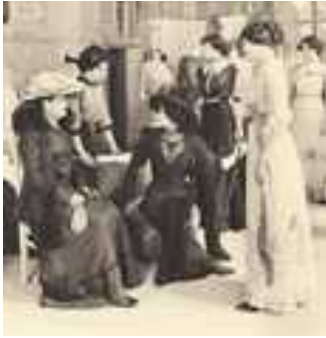
Fig. 4: Photograph of women's dress fitting at the House of Redfern in Paris. 1910s. Glamourdaze.