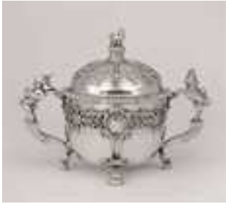
圖三：洗禮杯連蓋。Edward Feline，倫敦，1731 年。銀，28.5 x 39.5 公分。羅莎琳德和亞瑟·吉爾伯特收藏，並借予倫敦維多利亞與艾伯特博物館。

銀器是傳統的洗禮贈品。在都鐸王朝時期，在位國王都會為他教子或教女的洗禮儀式購買或訂製銀器。這件洗禮杯是國王喬治二世（1683－1760 年）於 1731 年 10 月 25 日贈予他的教女 Lady Emilia Lennox（1731－1814 年）。