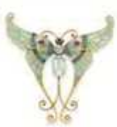
Fig. 5: A butterfly brooch. 1900. Boucheron. Aquamarine, opal, enamel, rubies, emeralds, diamond and gold. The collection of Elizabeth Taylor.