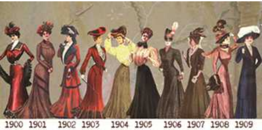
圖六：1900 至 1909 年女性時裝風格時間表。