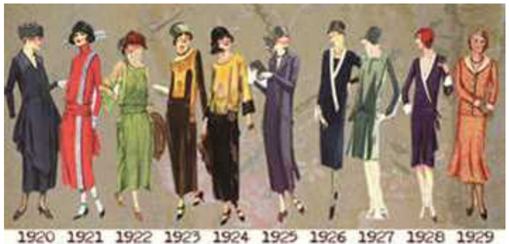
Figure 8: Timeline of women's fashion in the 1920s.

As the Egyptian revival continued into the Art Deco period, Chinese and Japanese themes were also widely adopted on jewellery and vanity cases. Chinese motifs first appeared in haute couture in 1923, the year of the Paris Opera Chinese Ball. This surge in interest in all things oriental developed partly as a result of expanding trade and cultural links with Japan and China. Natural scenes taken from Chinese and Japanese paintings became a common motif on vanities in the 20s. Lacloche Frères, a French firm originally established in Madrid in 1875 that rivalled Cartier and Van Cleef & Arpels (VCA) during the 20s, was known for its use of Japanese and Chinese motifs. A nécessaire (cat. 135) made with hard stone, is decorated with roses and flowers in amethysts