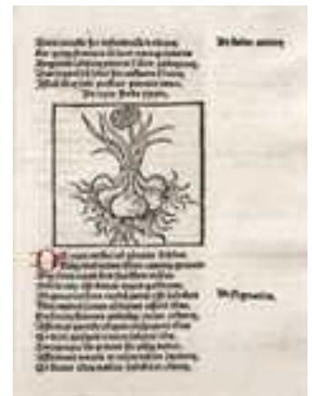
圖四：Macer Floridius 著作《De Viribus Herbarum》內的洋蔥圖例，日內瓦，約 1495 年。中世紀的草藥文獻是 15 世紀後花卉和動物設計的重要靈感來源。