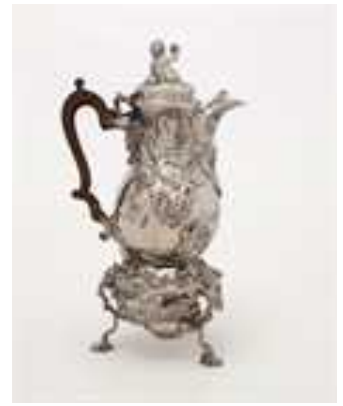
圖二：咖啡壺。保羅·德·拉米熱，1743 至 1744 年。銀和木，高 35.6 公分。羅莎琳德和亞瑟·吉爾伯特收藏，並借予倫敦維多利亞與艾伯特博物館。

其他國家銀匠的培訓不如法國般嚴謹。在英國，銀匠們需先接受七年的學徒訓練，通過專業的水平測驗，便能成為被僱用的合格銀匠及金匠協會會員。如法國，純銀標準和品質保證在十四世紀時被引入英國倫敦，並一直由 1327 年獲得皇家特許狀的金匠公司監控。每一件英國製造的銀器須備有四個標記（純銀標準、出產城市、製造者名稱和出產年份）並印於明顯的位置。純銀標記證明了此件銀器的白銀成分達到千分之九百五十二。最繁忙的鑒定中心位於倫敦、伯明翰和謝菲爾德這三個城市，均由「行走的獅子」（lion passant，一頭向左邊行走的獅子）標記來表示。規模較小的城市則使用其他的純銀標準標記，例如使用城堡標記的愛丁堡和使用帶皇冠豎琴標記的都柏林。德國和斯堪的納維亞（在地理上是指斯堪的納維亞半島，包括挪威和瑞典，文化與政治上則包含丹麥）都運用類似的鑒定系統。而在政局混亂的意大利，由於有著複雜的統治階級和權力鬥爭，直到 1871 年復興運動（意大利統一運動）時銀器標準系統才得到統一。