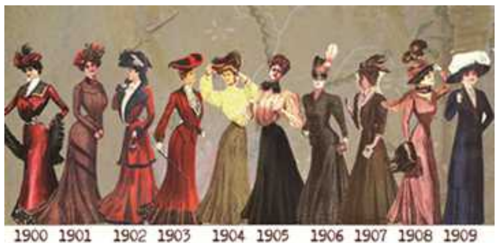
Fig. 6: Timeline of women's fashion in the 1900s. Glamourdaze.

Exhibition. Art Nouveau also became the first international decorative style of the modern age.