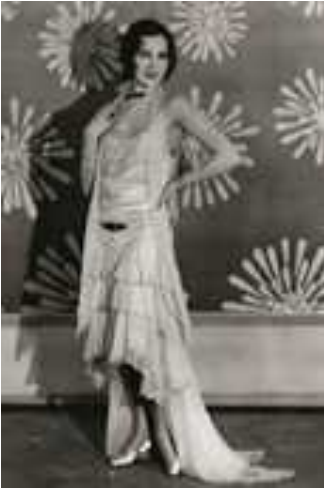
Fig. 7: Photograph of Fay Wray wearing Art Deco jewellery.

elegance that was associated with wealth and sophistication.