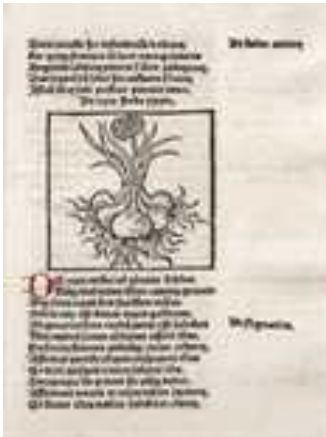
Fig. 4: An illustration of an onion in Macer Macer Floridius's De Viribus Herbarum , Geneva, around 1495.

Medieval herbal texts were an important source of floral and animal designers from the 15th century onward.