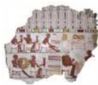
Fig. 1: Fragment of painted plaster from the tomb of Sebekhotep showing different stages and products of the jeweller's craft. Eighteenth Dynasty of ancient Egypt (c.1543–1292 B.C.). Limestone. 66 x 79cm. The British Museum, London.

Developed from amulets, body adornments like necklaces and pendants inherited the shapes and patterns that our ancestors believed had the magical power to protect wearers against dangers. Small animal figurines such as scarab beetles were adopted as amulets in ancient Egypt, who believed they were associated with Khepri, a deity that pushed the sun across the sky (much like a scarab beetle pushes dung along the dunes) and it became a symbol of rebirth. Other