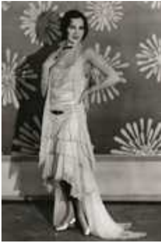
圖七：穿戴著裝飾藝術風格珠寶的 Fay Wray。Marie Claire 美麗佳人。

藝術運動風格珠寶則由 Charpentier 和 Louis Aucoc 等其他珠寶商供應給卡地亞。由於卡地亞並沒有完全跟隨新藝術運動的風格，因此很自然地從花環風格中發展出裝飾藝術運動風格的線條性。受中國和日本傳統漆器啟發，卡地亞創作出極具裝飾藝術運動風格的珠寶：結合寺廟的剪影、牡丹、鶴等東方圖案，成為當時最搶手的珠寶設計公司。