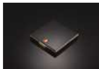
Fig. 9: Powder compact. Cartier, c. 1940-50. Silver, enamel and mirror. 7 x 7 x 1.5 cm. Liang Yi Museum, Hong Kong.

Under the direction of Gérard Boucheron, grandson of Frédéric Boucheron, Boucheron experienced a revival in the early 1940s and consequently produced pieces inspired by flowers and animals to accompany the 'New Look' movement of Christian Dior in 1947. The rectangular nécessaire (cat. 148) and powder compact (cat. 149) are decorated with pierced flora and fauna designs. The powder compact is executed with gold openwork in a beautifully feminine design of birds and flowers accented with rubies; whereas the nécessaire is decorated with a repetitive flower motif. The use of these repetitive patterns reflects the fascination with mechanisation that developed significantly during the war years.