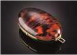
Fig. 10: Evening bag. Bulgari. c. 1950-60. Tortoiseshell, diamonds and gold. Width 16.5 cm. Liang Yi Museum, Hong Kong.

The “New Look” fashion movement championed by Dior brought femininity back in style. Together with other modernist movements during the post-war period which promoted the industrialisation of machines and technology, a new form of aesthetic for fashion and jewellery was developed. Many jewellers responded to the movement by adopting new techniques and materials such as acrylic plastics. Unlike the geometric stylisation of the Art Deco period, jewellery from after the war sees a new emphasis on nature and elegance.