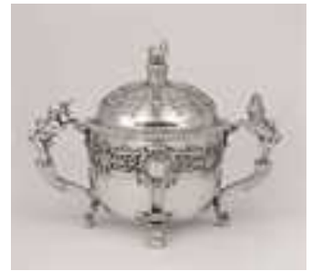
Fig. 3: Christening cup and cover. Edward Feline, London, 1731. Silver, 28.5 x 39.5cm. The Rosalinde and Arthur Gilbert Collection on loan to the Victoria and Albert Museum, London.

Whatever the circumstances of their creation, silver objects were produced in an astonishing variety of shapes and sizes, reflecting the array of influences that artisans translated into functional and decorative forms. While silver had long been associated with ceremony and achievement, during the sixteenth century the preponderance of presentation vessels in particular became even greater—perhaps because of the increased availability of silver. Political and civic successes were celebrated with monumental gifts of silver, as were childbirth and marriage, with a number of silver objects made in honour of these rituals. Christening cups and other objects like trays fulfilled both utilitarian as well as celebratory roles in commemorating a child's birth (fig. 3). Pride of ownership on such objects was expressed not only in the display of such silver but also in the coats of arms, monograms and inscriptions with which they were engraved.