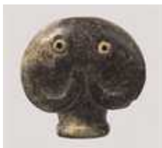
圖一：索貝霍特普（Sebekhotep）墓內的壁畫，顯示珠寶工藝生產的各階段。古埃及第十八王朝（約公元前 1543－1292 年）。石灰。66x79 公分。倫敦大英博物館。