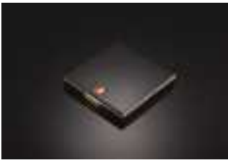
圖九：化妝盒。卡地亞。 約二十世紀四十至五十年 代。銀、琺瑯和鏡。 7 × 7 × 1.5 公分。兩依藏。

而同一時期在丹麥，喬治傑生（Georg Jensen A/S）出品的珠寶化妝盒亦反映動物圖案在北歐的流行。Georg Jensen 由喬治·阿瑟·傑生（Georg Arthur Jensen，1866 – 1953 年）於 1904 年成立。