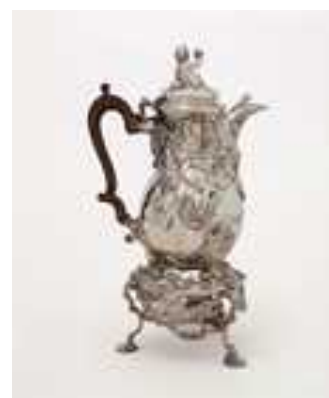
Fig. 2: Coffee-pot. Paul de Lamerie, 1743 – 44. Silver and wood, height 35.6cm. The Rosalinde and Arthur Gilbert Collection on loan to the Victoria and Albert Museum, London.

Unfortunately, because of the value of silver as a raw material, various fiscal crises of the late seventeenth and eighteenth centuries had a negative